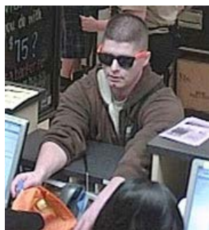
Suspect image #1