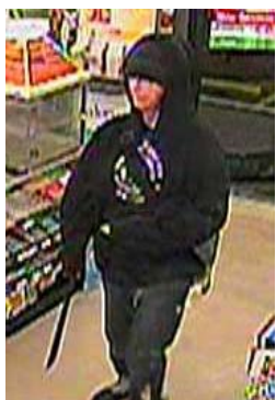
Suspect image #1