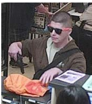
Suspect image #4