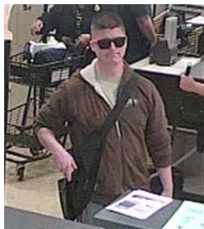
Suspect image #2