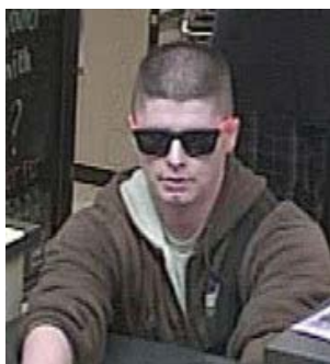
Suspect image #2