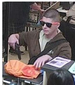
Suspect image #3