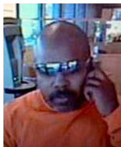
Unidentified Bank Robbery Suspect

Description: African-American male, approximately 5'6" to 5'8" tall, 190-200 pounds, balding, black facial hair, with dark spots on the side of both cheeks, last seen wearing sunglasses and an orange long-sleeve shirt.