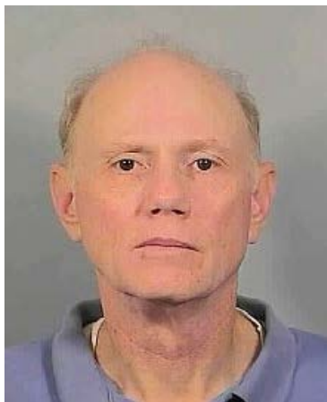
Sex Offender Wayne Page

PRIOR OFFENSES: Forcible Rape, Kidnapping with Intent to Commit Sex Crimes