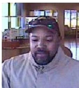
Unidentified Bank Robbery Suspect