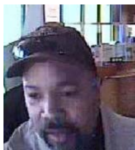
Unidentified Bank Robbery Suspect