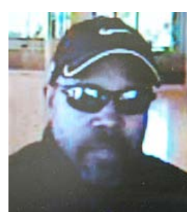
Unidentified Bank Robbery Suspect

San Jose: On Friday, 4/29/2011, at approximately 3:46 p.m., the suspect entered the Meriwest Credit Union, located at 5683 Cottle Road in San Jose, and demanded money from the teller after presenting a demand note. The unidentified suspect fled with an undisclosed amount of cash and remains at large.