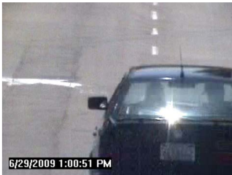
Suspect vehicle - 1995-1999 VW Jetta