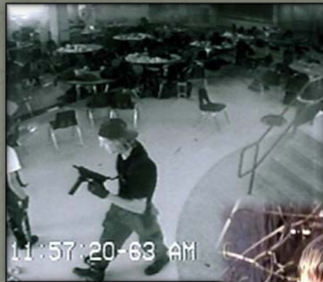
Columbine High School