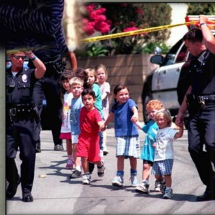
Sandy Hook Elementary School